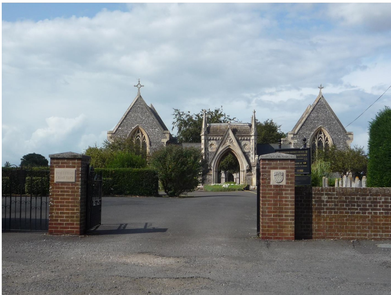
Chichester Cemetery

Of the 89 Commonwealth burials of the 1914-1918 war, the majority are in a War Graves Plot in Squares 121 and 126 bordering a path on the far right hand side of the cemetery. This was constructed by the City Corporation, who also erected the War Cross at the eastern end of the enclosed plot especially designed by Sir Reginald Blomfield and closely resembling the Commission's own Cross of Sacrifice. The names of the 1914-1918 war dead in the cemetery are engraved on the base of the Cross. There are also 75 Commonwealth burials of the 1939-1945 war here, mainly in two adjoining Church of England dedicated Squares, Nos. 115 and 159, in the south-western portion of the cemetery enclosed by a hedgerow on three sides, on the fourth side a wall bearing the inscription 1939-1945 THE MEN AND WOMEN BURIED IN THIS PLOT DIED IN THE SERVICE OF THEIR COUNTRY THEIR NAME LIVETH FOR EVERMORE. In the northern section a further Square, No. 42, is dedicated to Roman Catholic burials, there is a metal plaque bearing a similar inscription. There are also 7 non-Commonwealth war burials and 4 non World War burials in the care of C.W.G.C. within the cemetery. (Information from CWGC)