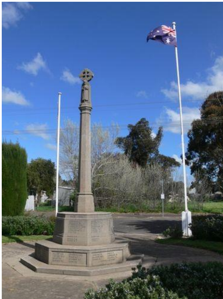
Glenthompson War Memorial