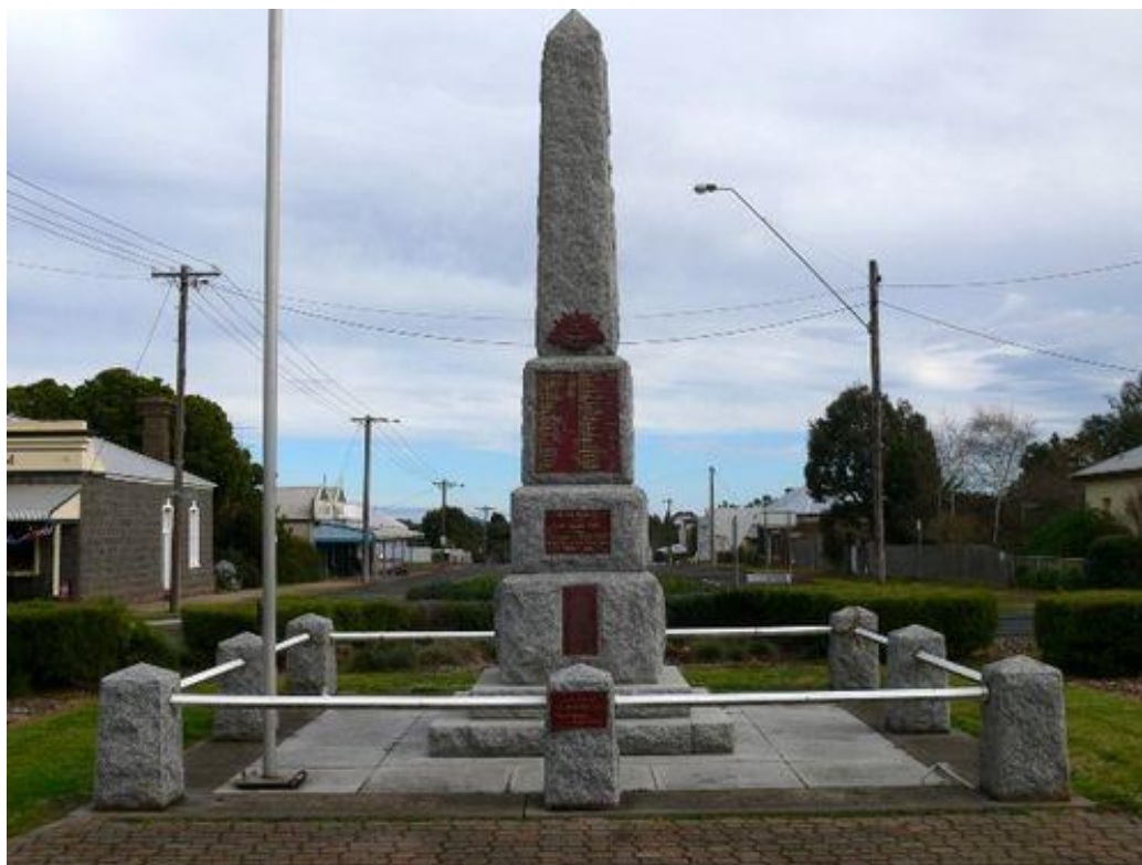
Penshurst War Memorial