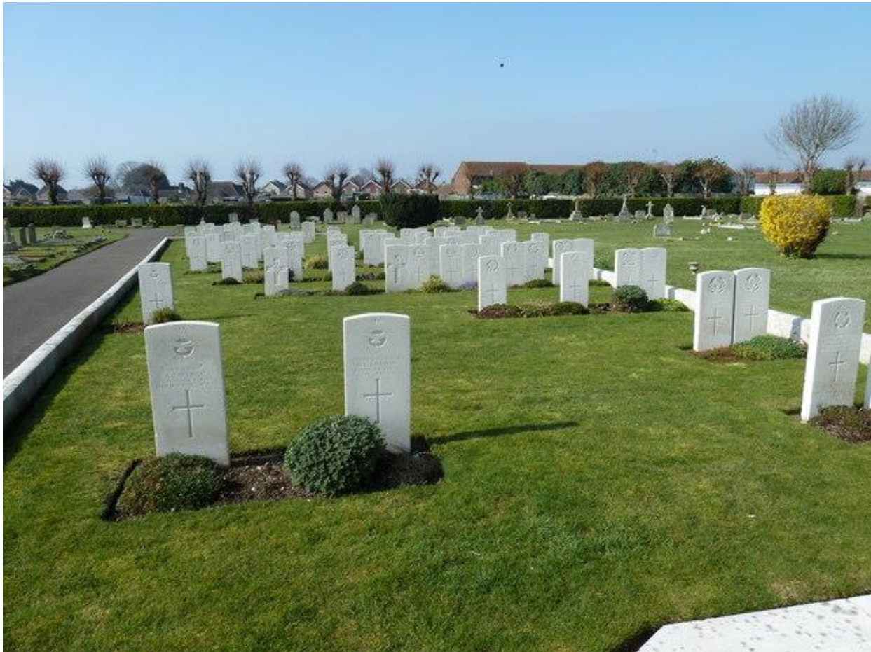
Some War Graves in Chichester Cemetery